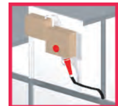
MAINS DISTRIBUTION BOARD - PER BLOCK

INDEX group ltd exhibition services www.indexgroup.org